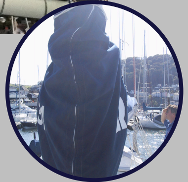
Zip up cover around mast

Our stacker covers are made in heavy weight uncoated acrylic canvas which allows a small amount of breathability to the fabric, the colour is optional although we should be able to match that of the sprayhood if you require. Over the years we have continuously developed and improved our design to arrive at the optimum design. We offer a two part cover with a main body which finishes about 0.6m from the mast and a separate front bonnet that passes over the head and luff of the sail when you have finished sailing. With the cover finishing short of the mast there is less cover to constrain the sail so it is easier to hoist and lower the sail than a cover that is one piece or finishes very close to the mast. The batten pocket is sewn close to the top so that the cover is held open by the lazy jacks when the mainsail is up, and when the cover is closed water can not accumulate in the cover. Zips with pairs of sliders are fitted to each side of the cover or for loose footed