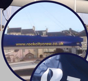
Option for text along the boom cover (boat name or business name)