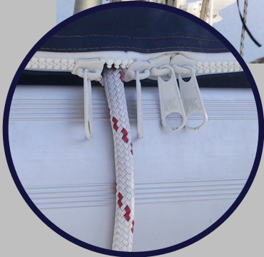
Gaps or zips for ropes to come through along boom.